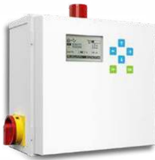
WSB® clean control panel and Web Viewer for remote monitoring of each system.