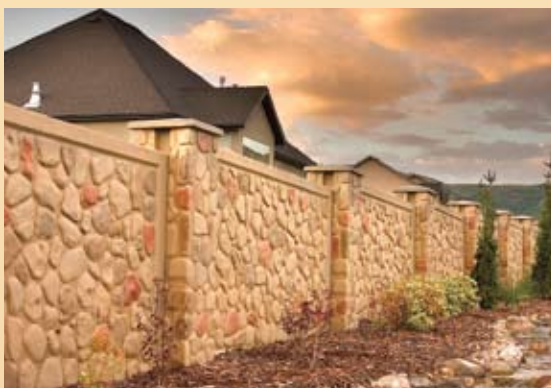
TOP: LEDGESTONE WITH WROUGHT IRON GATE BOTTOM: COBBLE