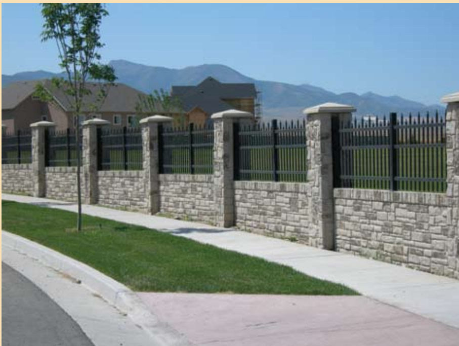
TOP: SIERRA DRYFIT BOTTOM: ASHLAR COLUMNS WITH LEDGE STONE/WROUGHT IRON PANELS

One of the things Verti-Crete customers like most about our walls is what they don't see—specifically, a construction crew and equipment on their property for weeks on end. Our unique design streamlines the installation process and allows for incredible flexibility in configuration. Unlike the hassle of precisely digging, maneuvering, and setting traditional H-posts, Verti-Crete posts are installed over footings with rebar anchors. After the footings are set, Verti-Crete's hollow-core posts are set over the rebar to rest firmly on each concrete base. Panels are then set in place to fit securely within notches cast into the posts. After each section is plumbed and leveled, the columns are filled with concrete to secure the connection between post and footing. This process results in a faster installation and the most cost efficient and secure connection available.