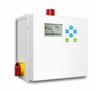
WSB® clean control panel and Web Viewer for remote monitoring of each system.